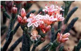
Clay-Loving Wild Buckwheat

This event will be sponsored by the Friends of Colorado Natural Areas and the Foundation for Colorado State Parks, so contributions will be tax deductible . We want to give a special thanks to all of you who have made contributions to the CNAP program or to the Friends Group over the last several years. For questions, feel free to call 720-855-8584 or email Friends_of_CNAP@comcast.net . Thank you!