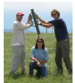
High Mesa fence building

Why does CNAP need more Friends? The Friends Group can help the Natural Areas Program fund and manage some exciting projects for Outreach, Protection and Acquisition. There are projects such as: putting up more interpretative signs; selling a coffee table book, Natural Areas calendars and post cards; building fences; and building endowments for conservation easements. The private funds raised can be applied to projects that are difficult to accomplish with state funds. For example, the $13,000 raised for the Clay-Loving Wild Buckwheat last year was very important for the protection of that plant. Our goal is to have over 100 people show up at the November event and sign up for ways to support CNAP's goals. We would like find three people to sign up to be official Friends Board Members, especially a treasurer to manage funds and negotiate contracts, and people to help organize an annual fall fundraiser, maybe an art auction.